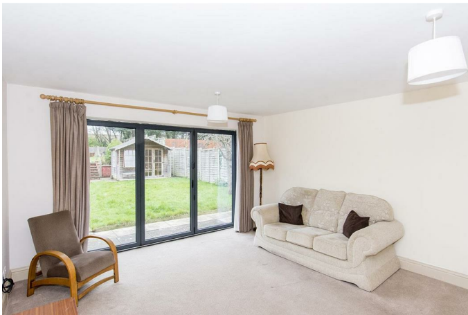
Double-glazed bi-fold doors leading out to the rear garden. UPVC double-glazed window to the side. Radiator.