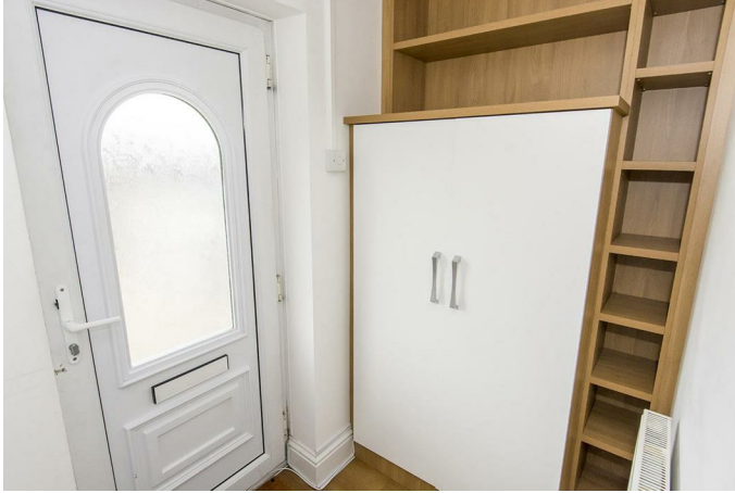
UPVC double-glazed front entrance door. Radiator.