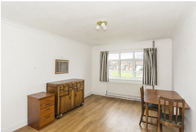
Bedroom One 16'4" x 10'6" (4.98m x 3.20m)