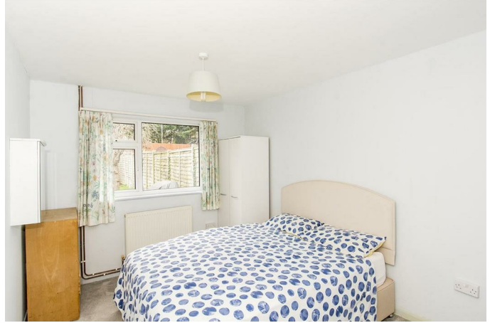
UPVC double-glazed window to rear. Fitted wardrobe. Radiator.