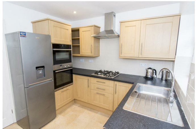
UPVC double-glazed window to side. UPVC double-glazed side entrance door. Fitted range of modern wall and floor mounted kitchen units with roll edge work tops over. Stainless steel sink. Electric oven with built in microwave. Gas hob with extractor hood over. Space for fridge/freezer. Space and plumbing for washing machine.