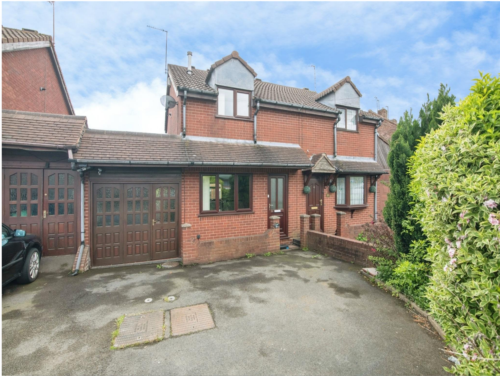
Pale Street, Woodsetton Dudley DY3 2BJ