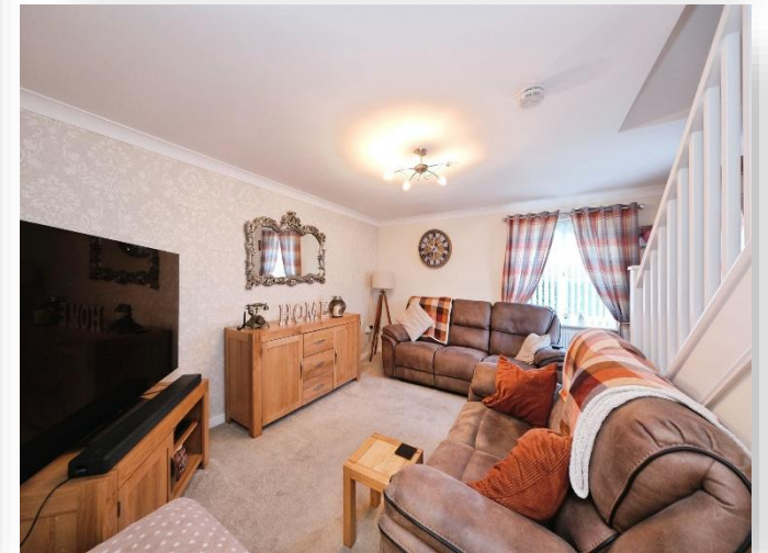
West Moor Croft, Goldthorpe Rotherham S63 9FL