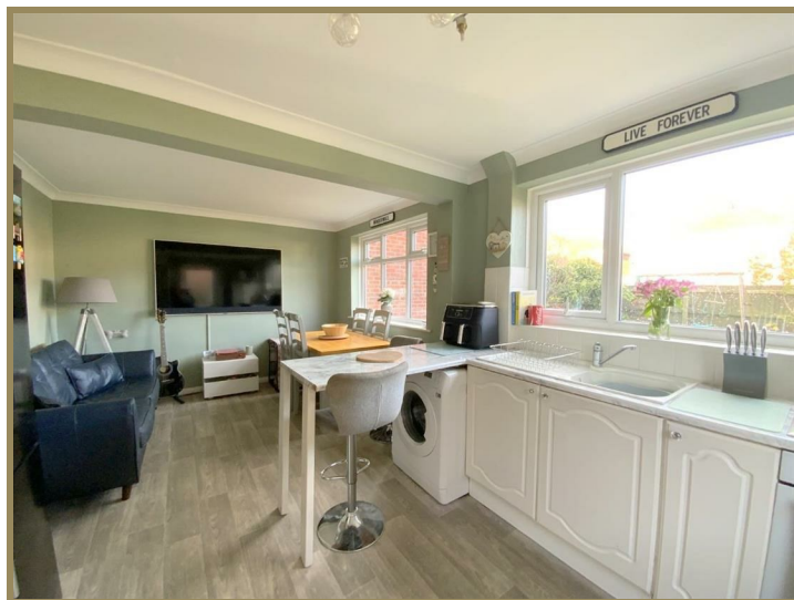
43 Greyfriars, Grimsby, North East Lincolnshire, DN37 9QT £160,000