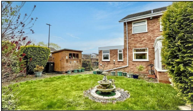
Oversley Road, Sutton Coldfield, B76 1XA