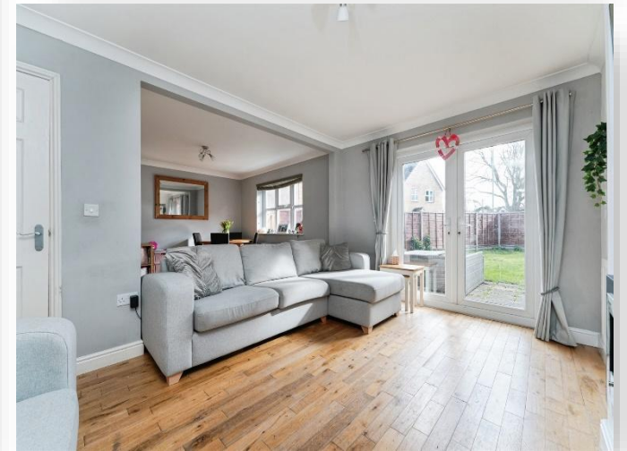
Green Acre Close, Mundford, Thetford, IP26 5EX