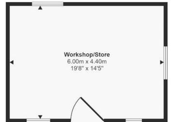
Workshop/Store Approx 26 sq m / 284 sq ft

Whilst every attempt has been made to ensure the accuracy of the floorplan contained here, measurements of doors, windows, rooms and any other items are approximate and no responsibility is taken for any error, omission or mis-statement. This plan is for illustrative purposes only and should be used as such by any prospective purchaser. The services, systems and appliances shown have not been tested and no guarantee as to their operability or efficiency can be given. Made with Metropix 62025