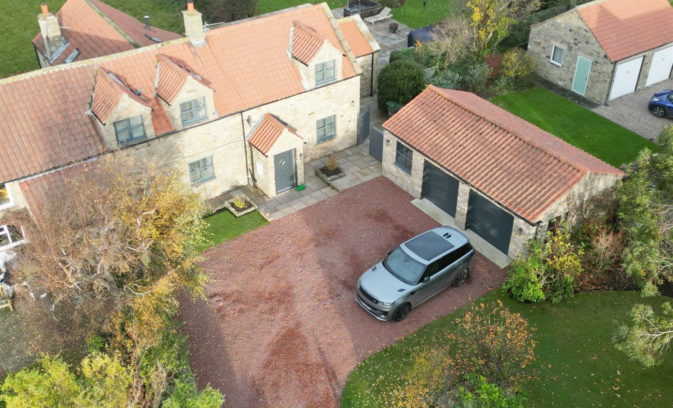
2 Rose Cottage Caldwell, Richmond, DL11 7QB £645,000