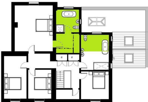
FIRST FLOOR PLANNING GRANTED