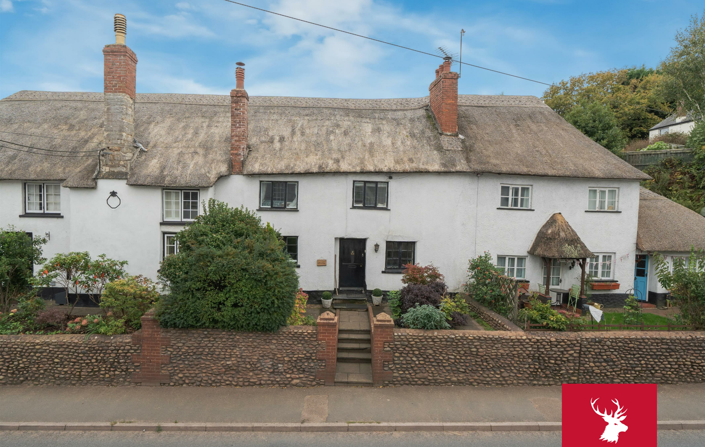
Ham Cottage Station Road