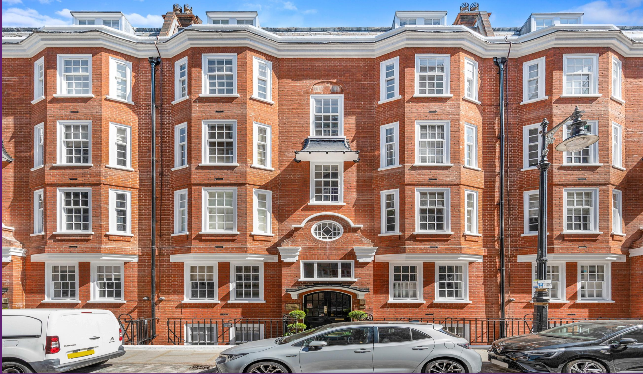
Garrick House Carrington Street, W1J