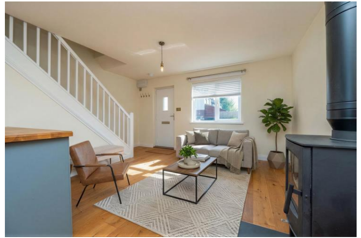
(Virtual stage image above)