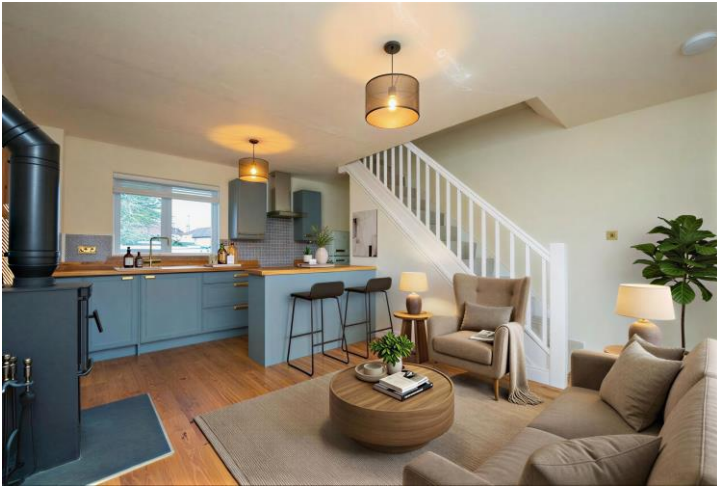
(Virtual stage image above)