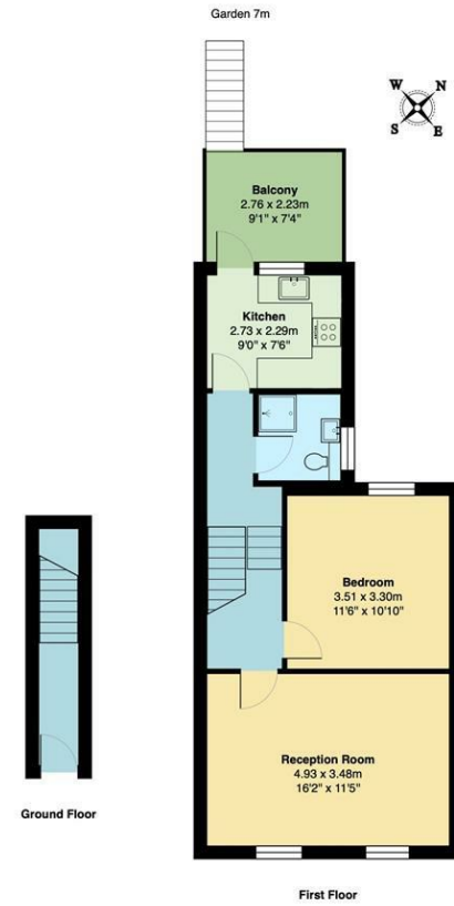
Total Area: 50.6 m 2 ... 545 ft 2 (excluding balcony) All measurements are approximate and for display purposes only.