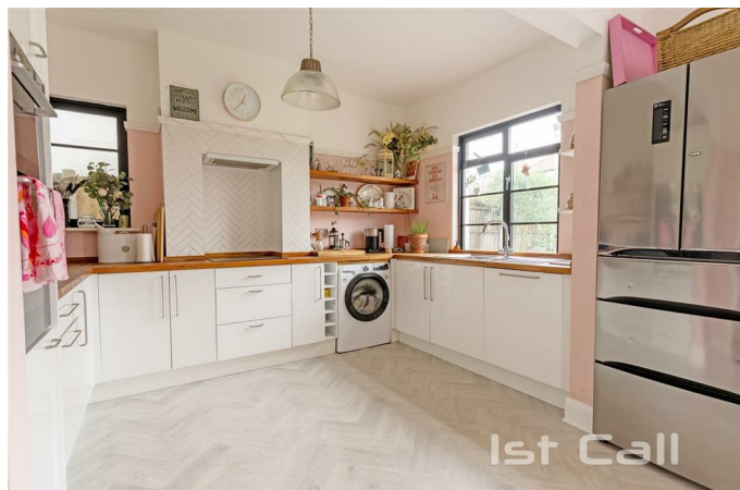
Kitchen 11'11" x 7'10" (3.63m x 2.39m)