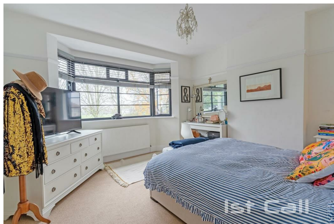
Bedroom 1 13'10" x 13'6" into bay (4.22m x 4.11m into bay)