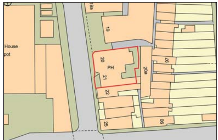
Licence Number: ES 100020372