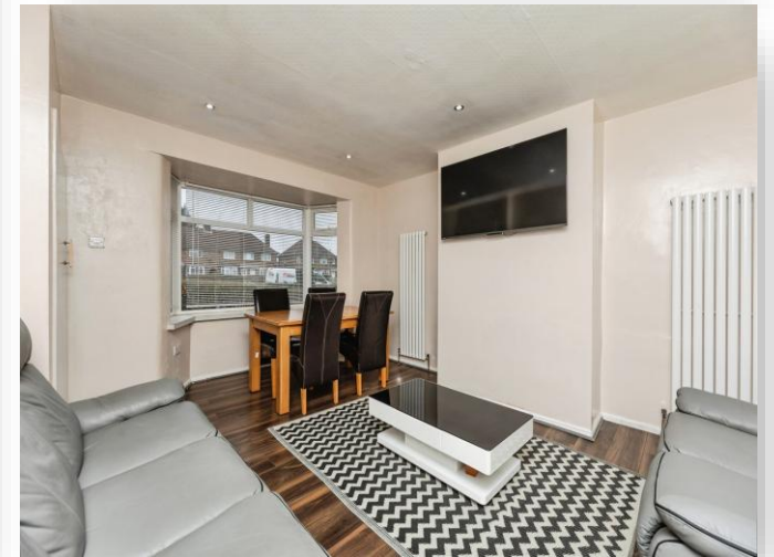
Middleton Road, Leeds LS10 3JH