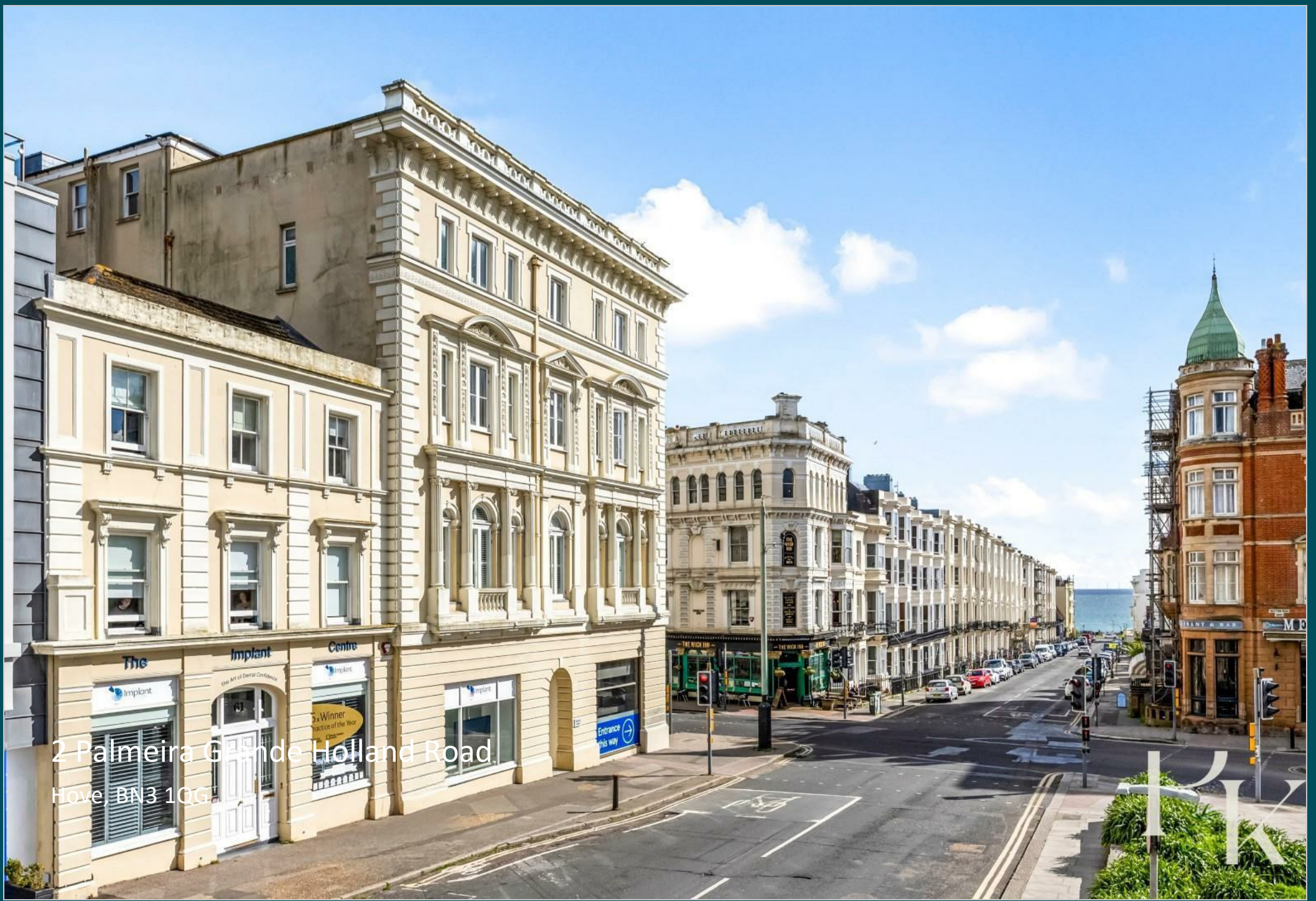
2 Palmeira Grande Holland Road Hove, BN3 1QG