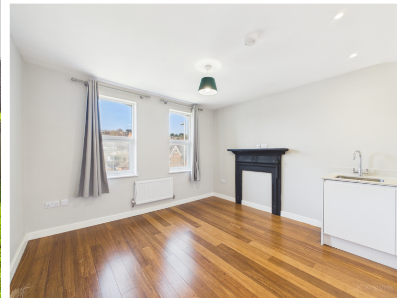
Flat 2 14 Hughenden Road, High Wycombe, Buckinghamshire, HP13 5DT