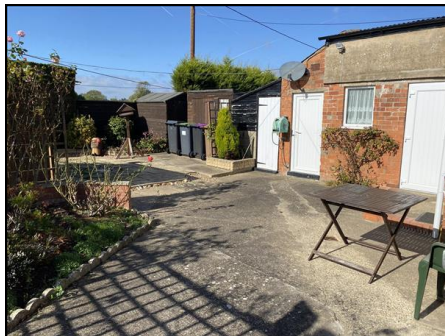
Further Garden Aspect