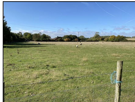
View To Rear