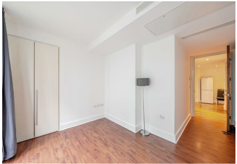
Praed Street, Paddington, London £3,950 Per Month Not specified