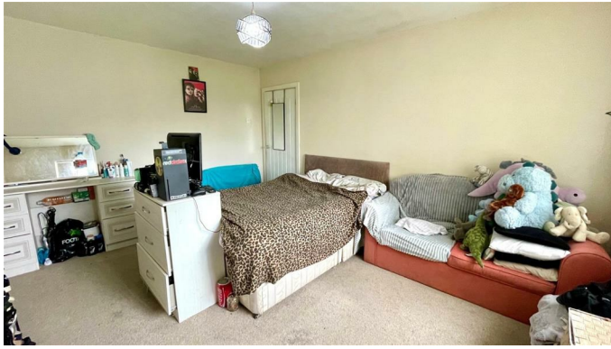
BEDROOM 2 11'5" x 9'11" (3.50m x 3.04m )