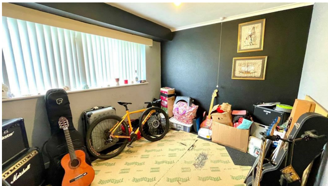
BEDROOM 3 11'3" x 9'4" (3.43m x 2.85m )

Upvc double glazed window, coving, double radiator.