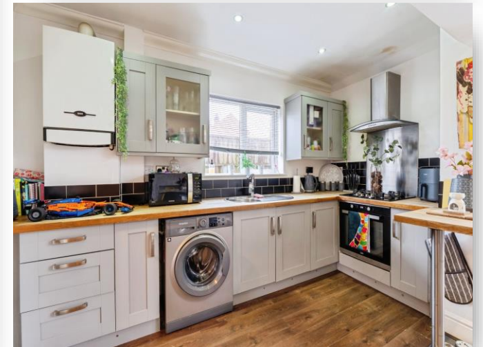
Belton Road, Leicester LE3 2GD