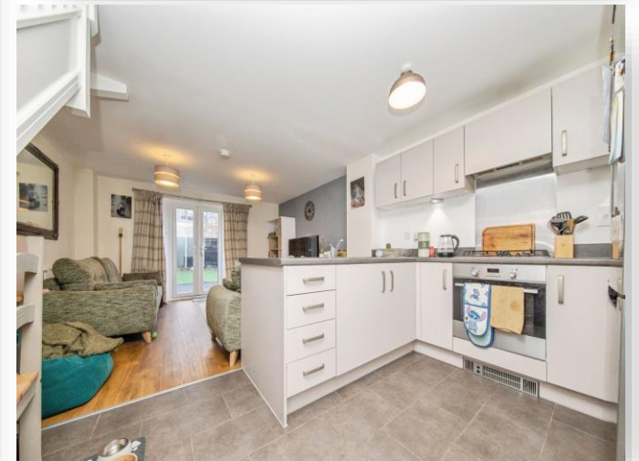
Vale View Road, Sroughton, Ipswich, IP8 3FG