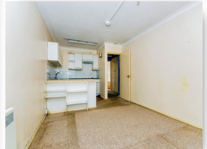
Brancaster Court, Staithe Road, Wisbech PE13 3TN