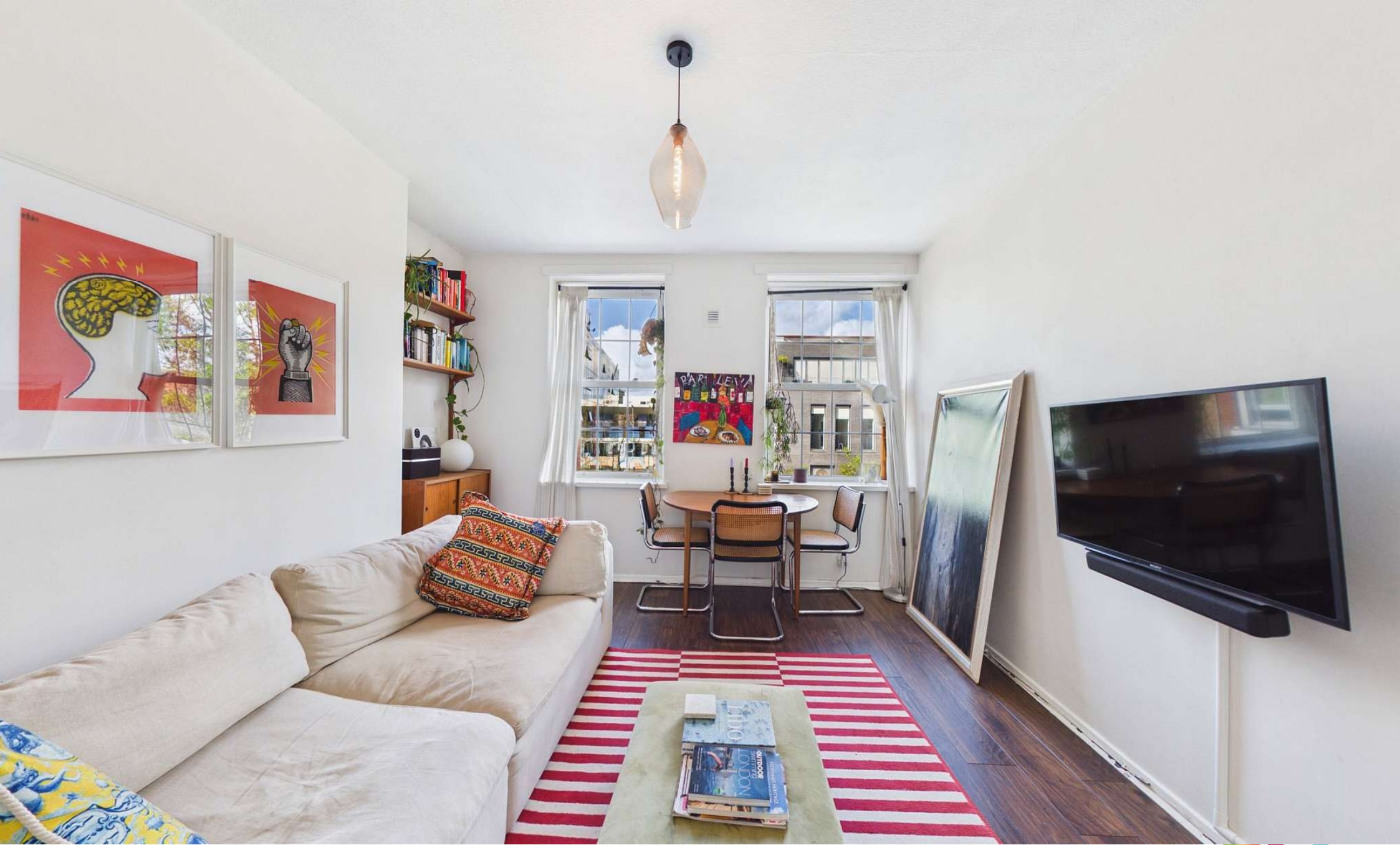
Primrose House Peckham Hill Street, London SE15 5SS