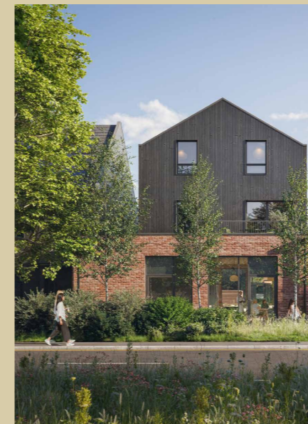
Computer generated images are indicative only