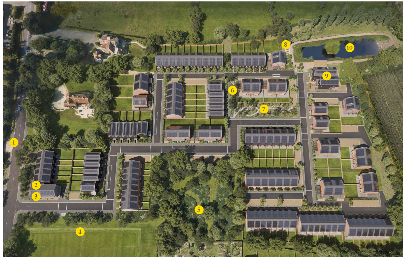
Site map is indicative only

Better for the environment and better for you, each design-led home is energy efficient. Carpenters Yard is the UK's first development to offer all homes with zero energy bills for five years, guaranteed through our partnership with Octopus Energy.*