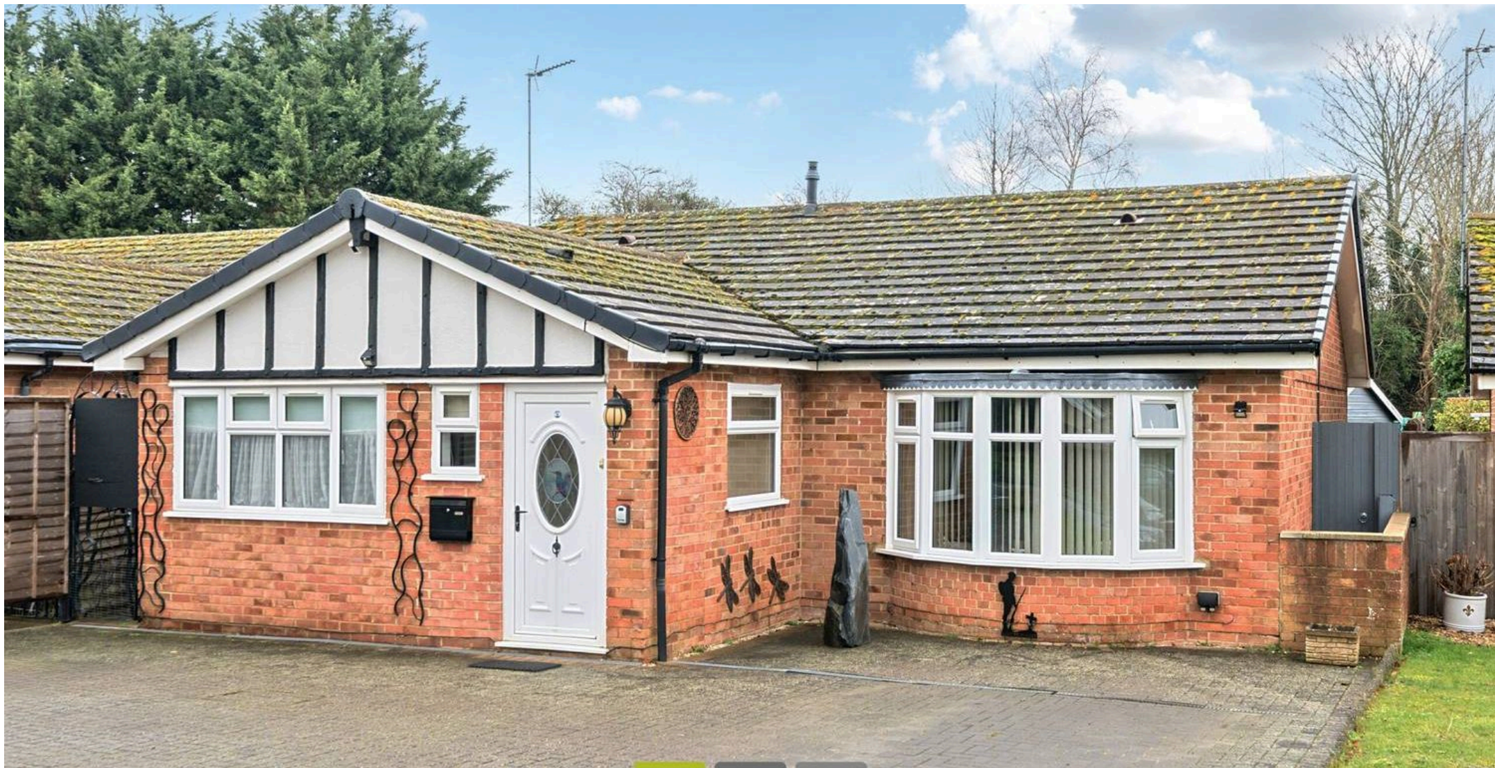
104 Bucknell Road, Bicester Bicester