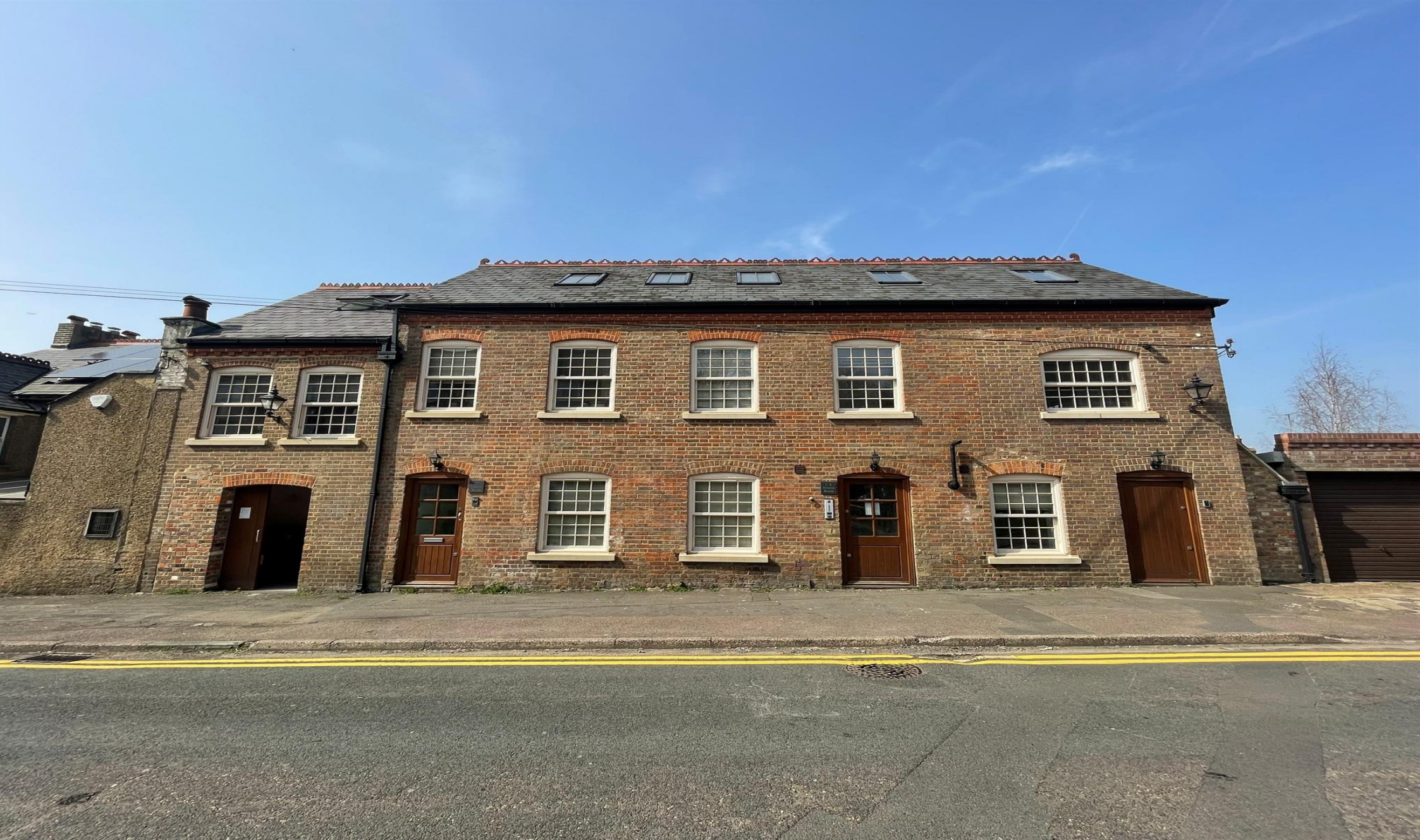
Victoria House Victoria Road, Chesham HP5 3FF