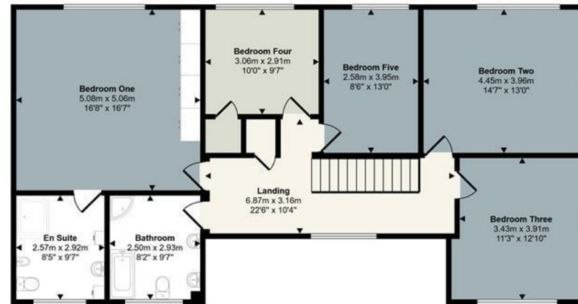
Ground Floor Approx 114 sq m / 1228 sq ft

This floorplan is only for illustrative purposes and is not to scale. Measurements of rooms, doors, windows, and any items are approximate and no responsibility is taken for any error, omission or mis-statement. Icons of items such as bathroom suites are representations only and may not look like the real items. Made with Made Snappy 360.