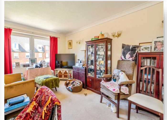
Homecroft House Sylvan Way, Bognor Regis PO21 2NQ