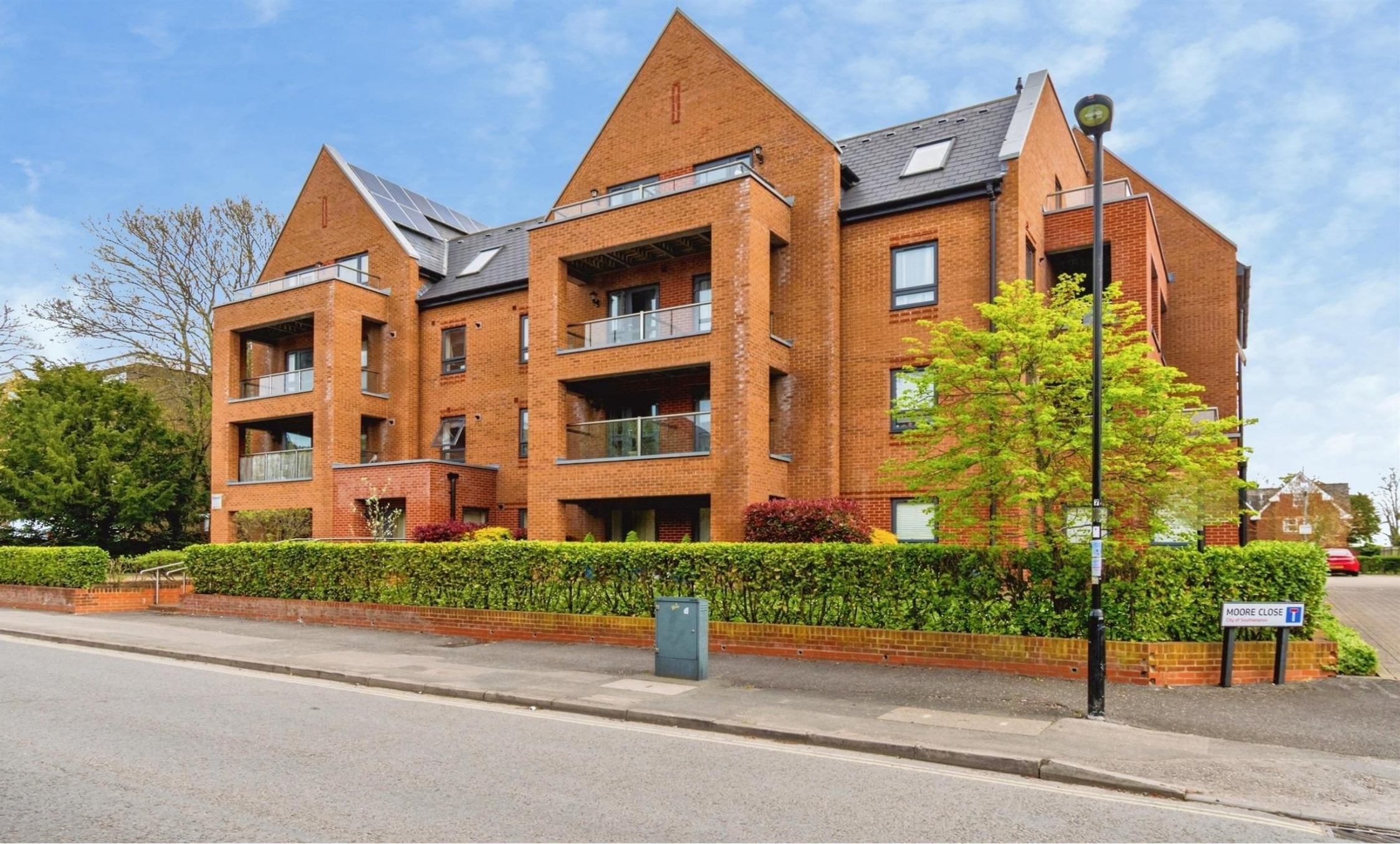
Moore Close, Southampton SO15 2RS