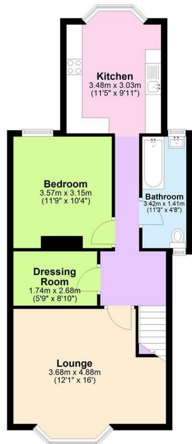
This floorplan is for illustration purposes only. The room sizes, locations of doors, windows and other features are approximate. Plan produced using PlanUp.