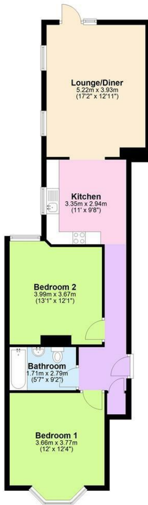
This floorplan is for illustration purposes only. The room sizes, locations of doors, windows and other features are approximate. Plan produced using PlanUp.