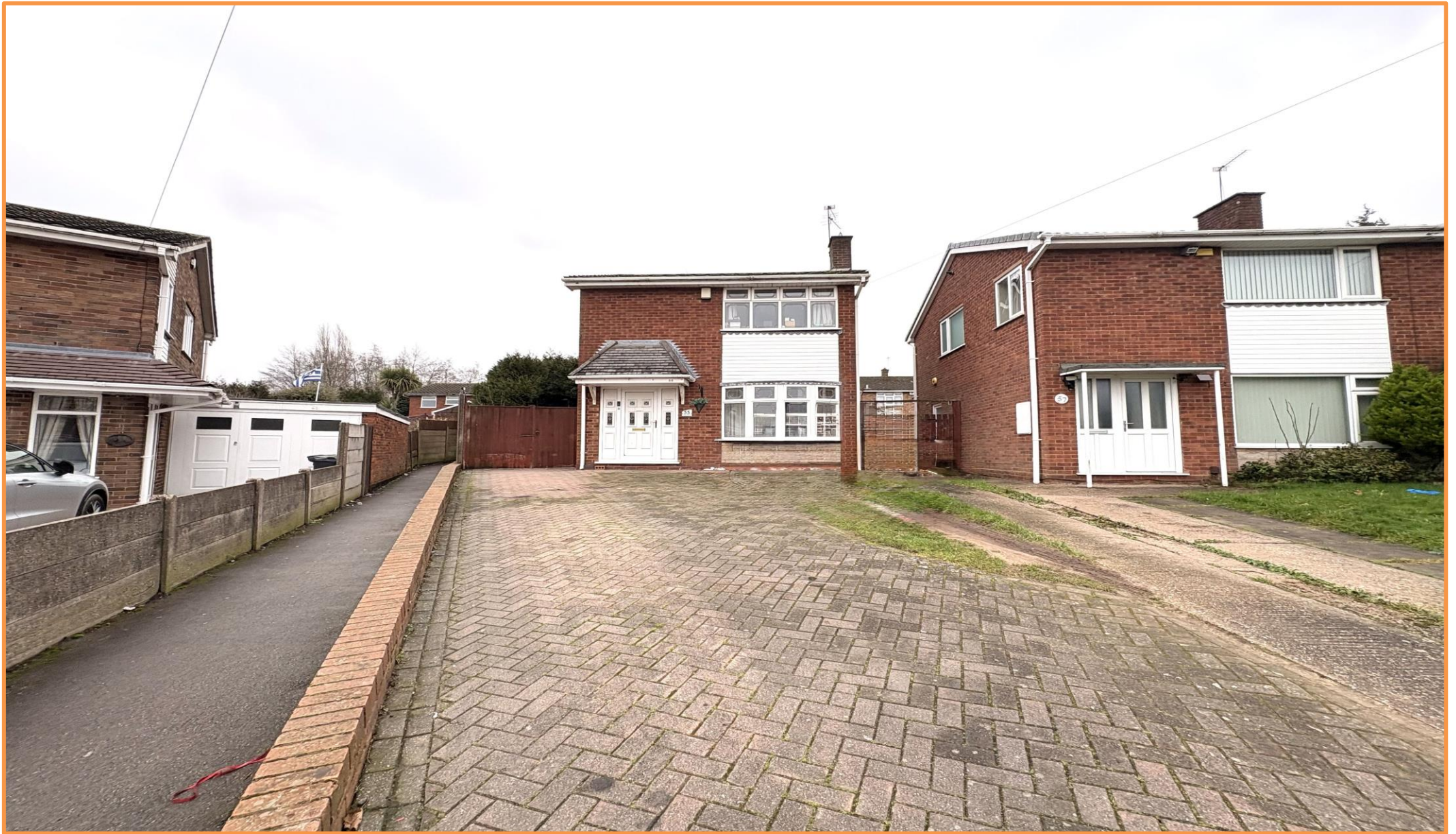
Longwood Rise, Willenhall, WV12 4AZ