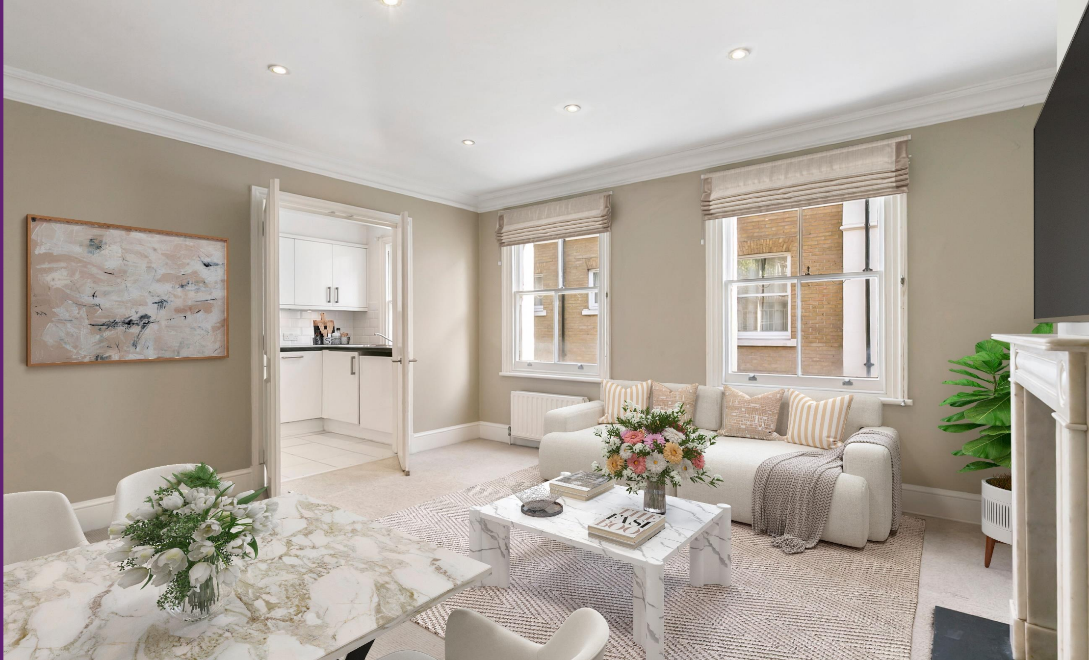
Stanhope Mews West South Kensington, SW7