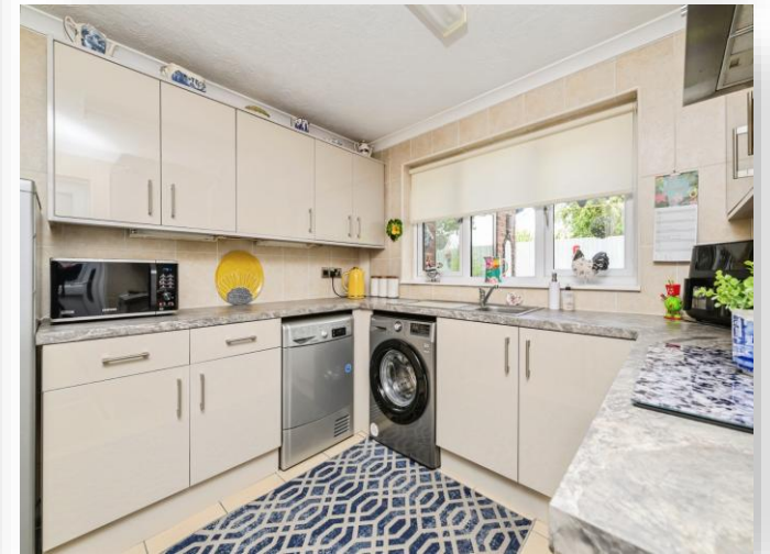
Vixen Close, Yaxley Peterborough PE7 3JN