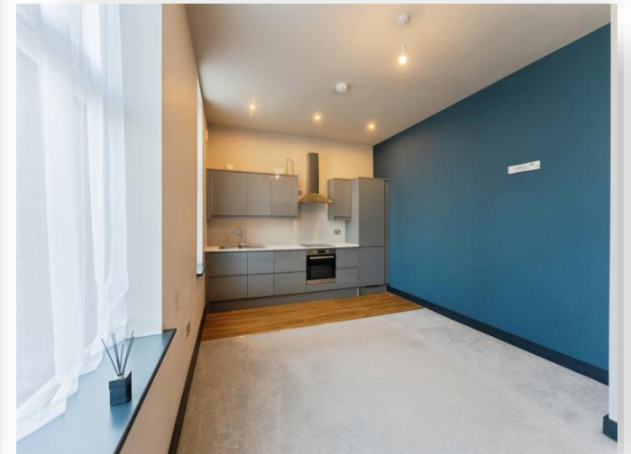
Gibson House, Gibson House Drive, Wallasey, CH44 8AX