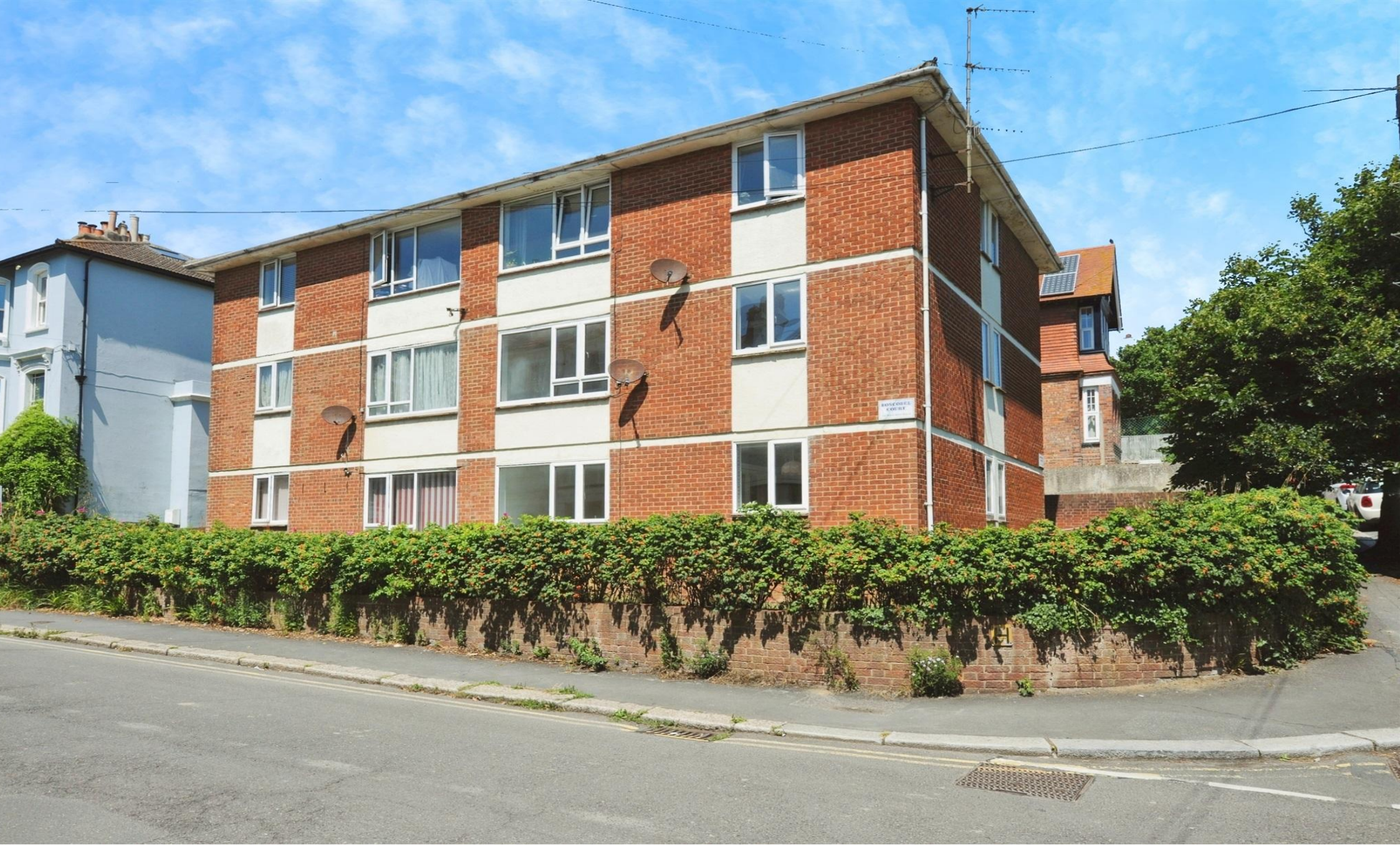
Boscobel Court - West Hill Road, ST. LEONARDS-ON-SEA TN38 0ND