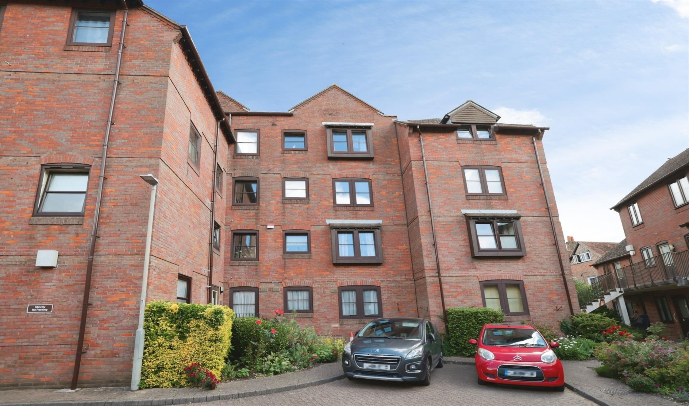
Town Bridge Court, Chesham HP5 1LN