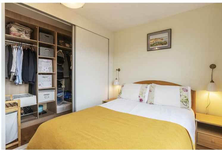
Bedroom 3 9'10" x 11'6" (3m x 3.51m )