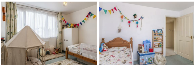
Bedroom 4 10'7 x 8'10 (3.23m x 2.69m)