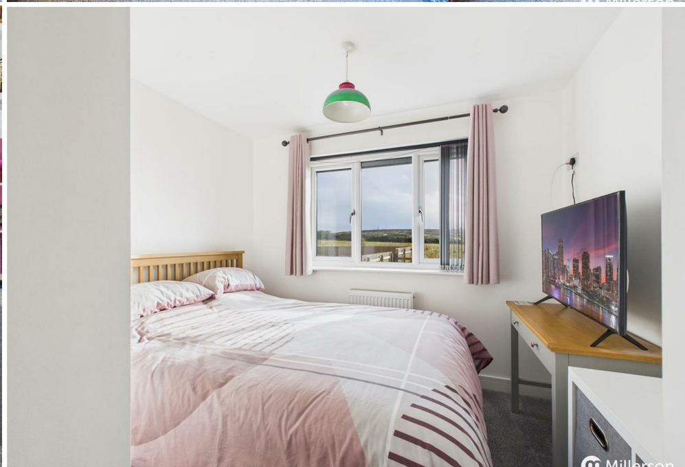
Troon Moor, Troon, Camborne, TR14 9HX