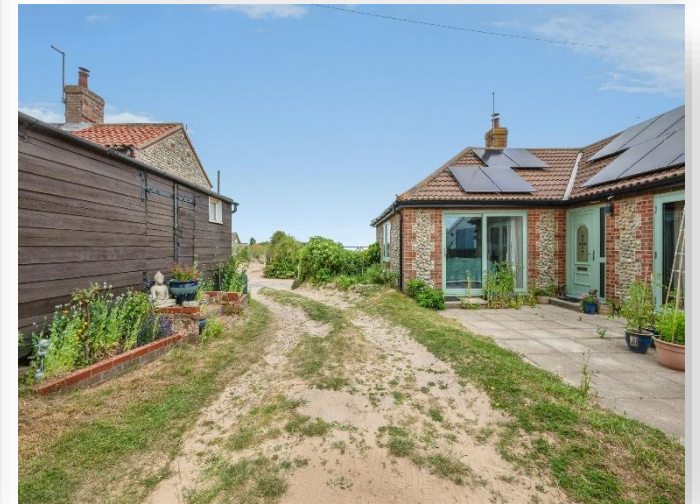
Coast Bungalow Keswick Road, Bacton Norwich NR12 0HE