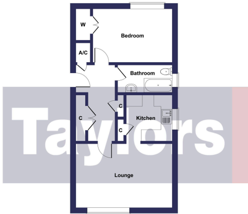
Pebble Close, Stourbridge, West Midlands, DY8 1LE

FOR GUIDE PURPOSES ONLY: Whilst every attempt has been made to ensure the accuracy of the floor plan contained here, measurements of doors, windows, rooms and any other items are approximate and no responsibility is taken for any error, omission, or mis-statement. This plan is for illustrative purposes only and should be used as such by any prospective purchaser. The services, systems and appliances shown have not been tested and no guarantee as to their operability or efficiency can be given. This floor plan is provided strictly for the purpose of providing a guide and is not intended to be sufficiently accurate for any purpose. Taylors Estate Agents do not accept any responsibility for errors or misuse. Prospective buyers must always seek their own verification of a layout, or seek the advice of their own professional advisors (surveyor or solicitor).