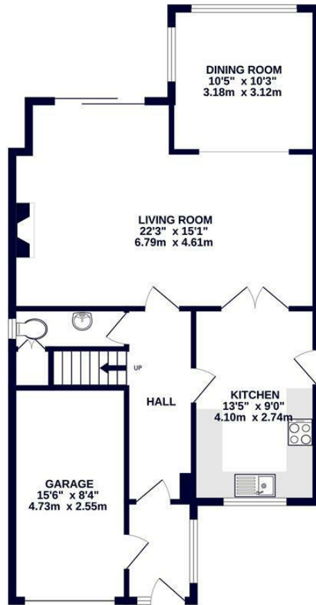
GROUND FLOOR 805 sq.ft. (74.8 sq.m.) approx.