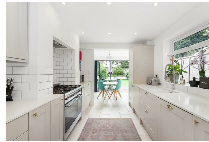
Brafferton Road, CR0 Approximate Gross Internal Area 100.3 sq m / 1080 sq ft