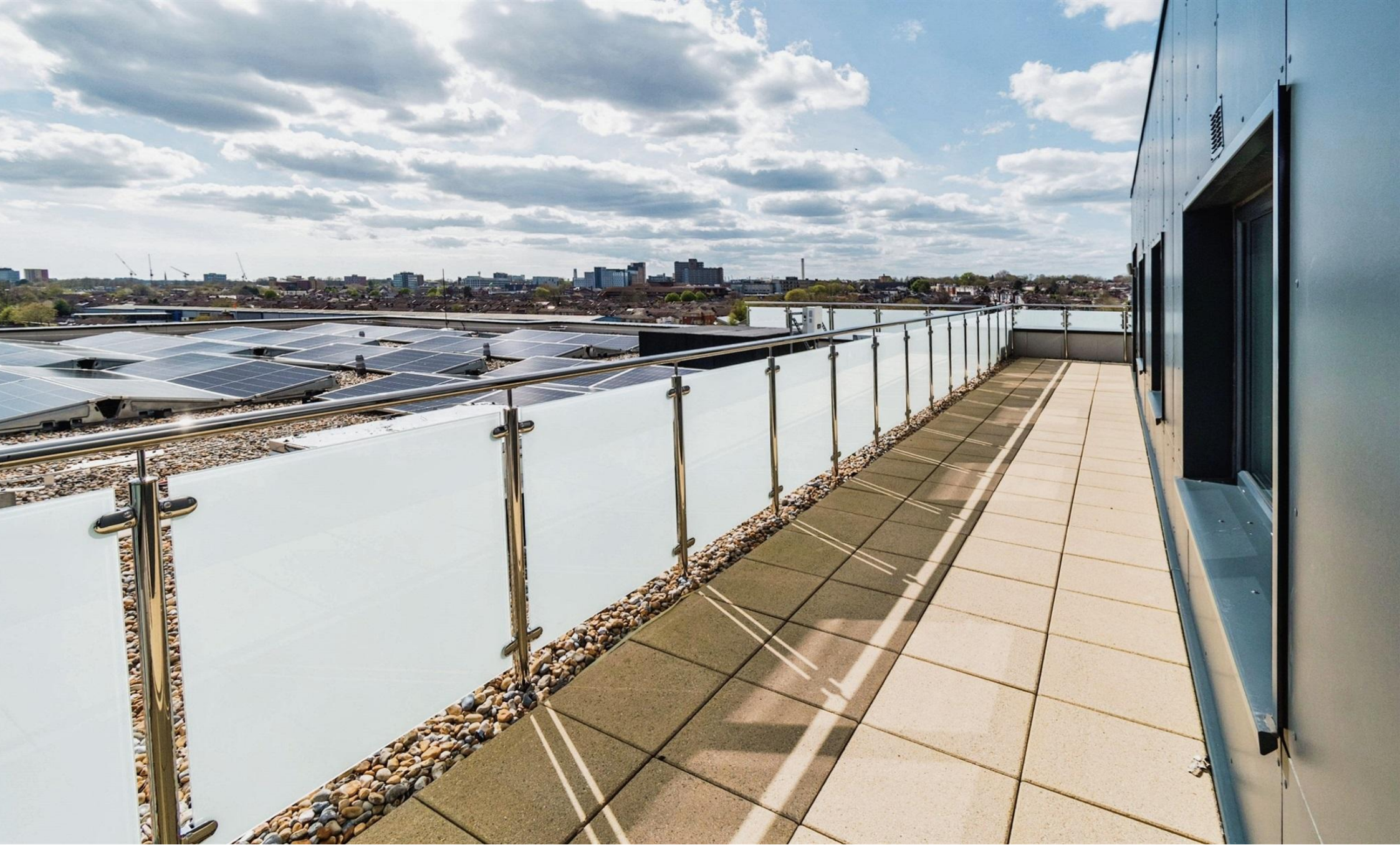
Granada House, Meridian Way, Southampton SO14 0FT