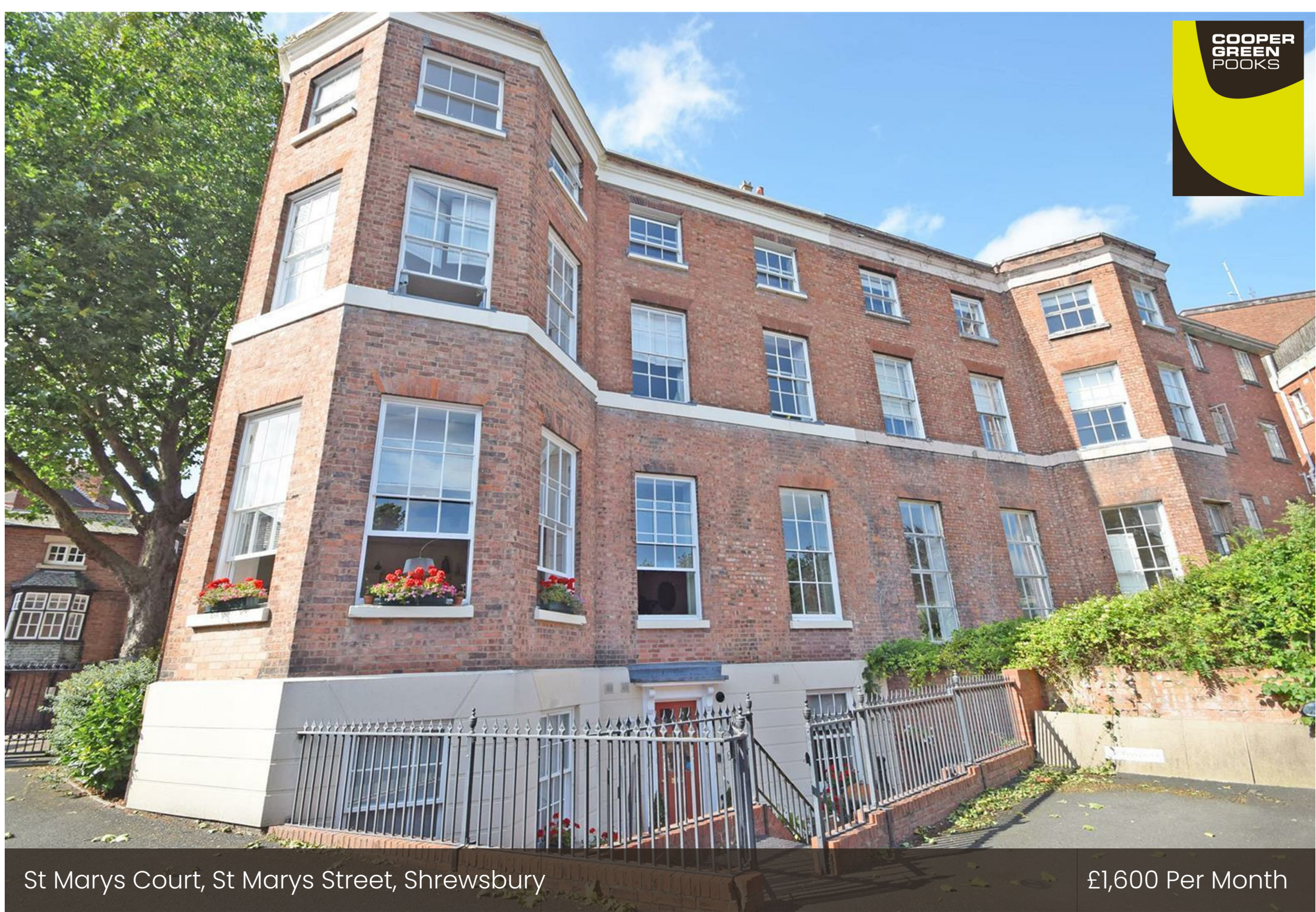
St Marys Court, St Marys Street, Shrewsbury