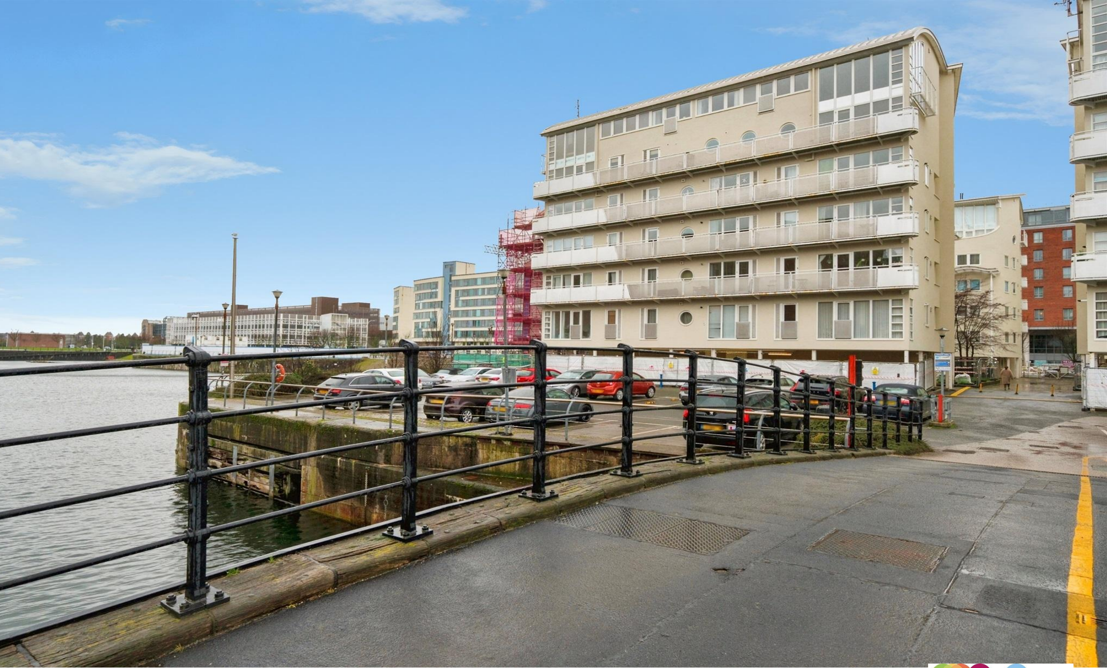
Royal Quay, Liverpool L3 4ET