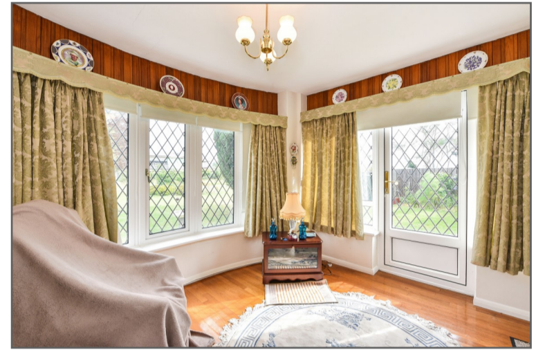
Deesfield, Harbour Road, Bosham, PO18 8JE