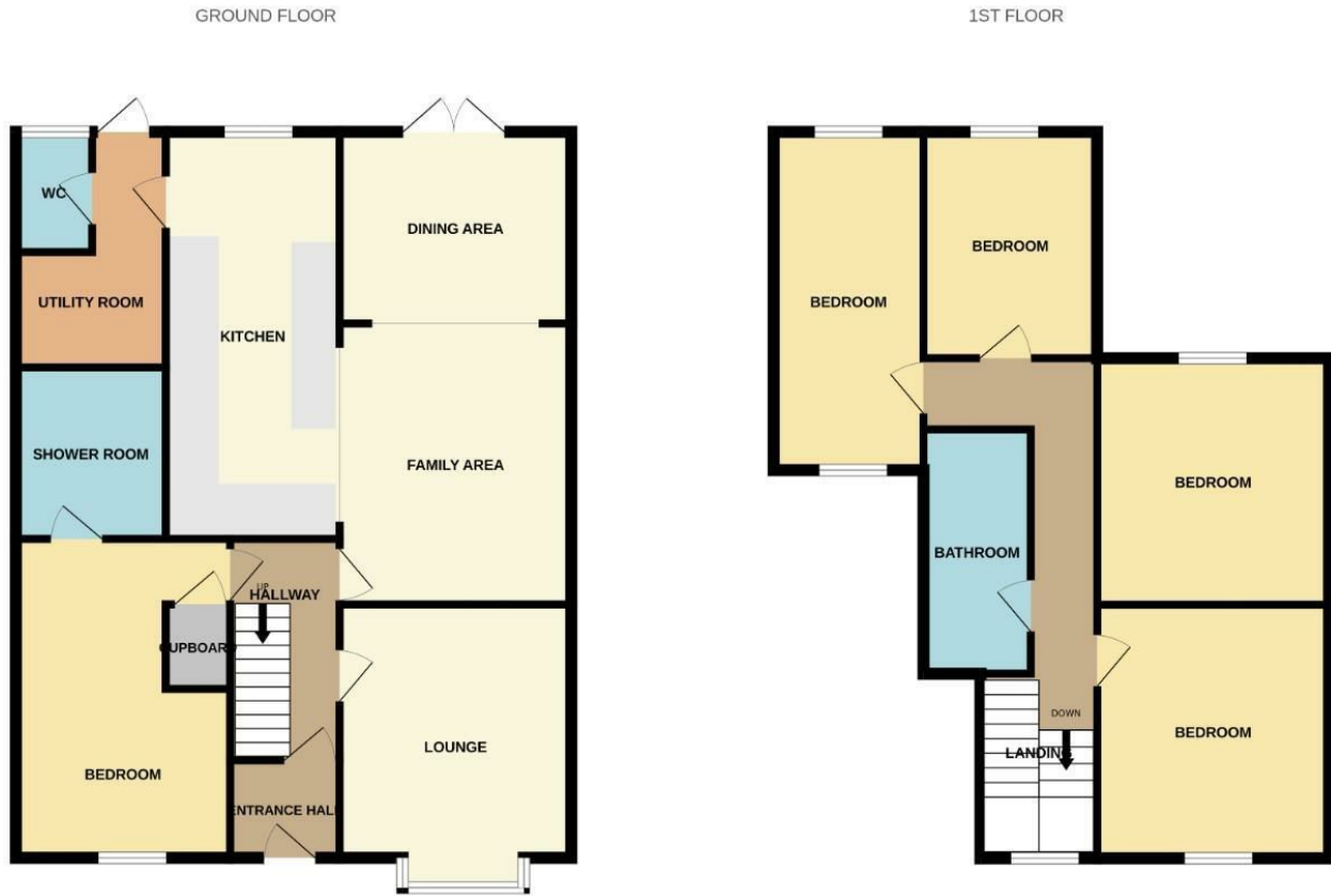
FIVE BEDROOM DETACHED

Whilst every attempt has been made to ensure the accuracy of the floorplan contained here, measurements of doors, windows, rooms and any other items are approximate and no responsibility is taken for any error, omission or mis-statement. This plan is for illustrative purposes only and should be used as such by any prospective purchaser. The services, systems and appliances shown have not been tested and no guarantee as to their operability or efficiency can be given. Made with Metropix ©2026