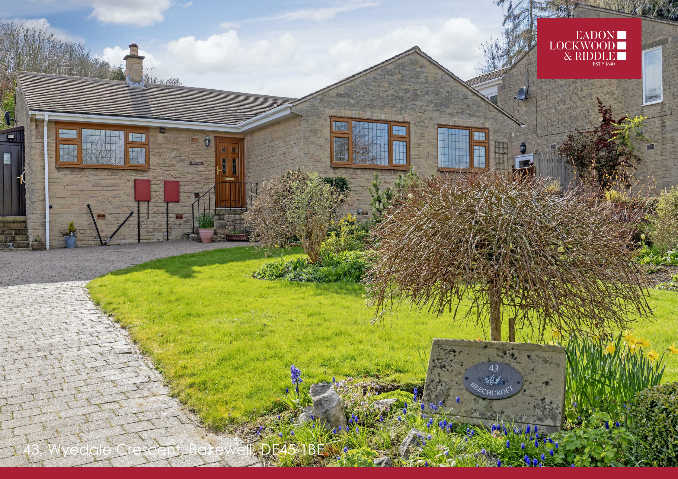
43, Wyedale Crescent, Bakewell, DE45 1BE