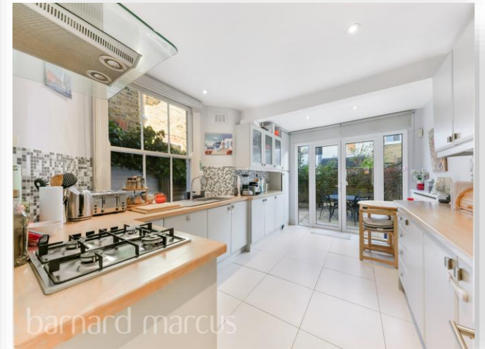
Ingelow Road, London SW8 3PE